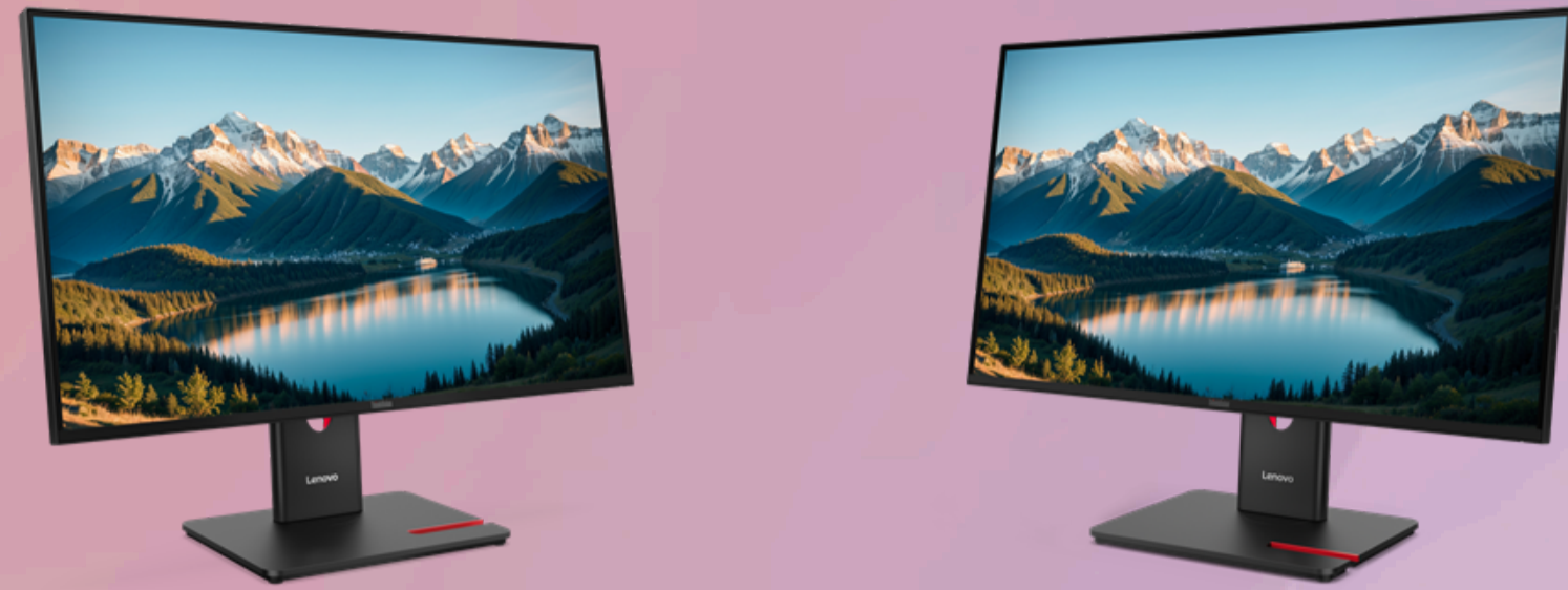
The product images are for illustration purposes only. Actual product appearance, ports, keyboard layout, and accessories may vary by model.