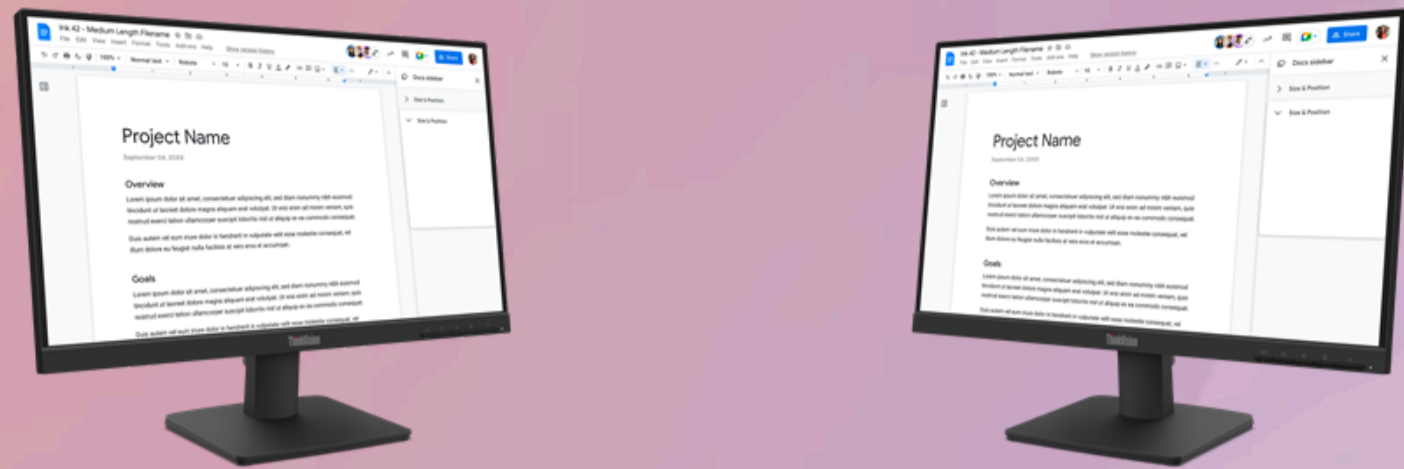
The product images are for illustration purposes only. Actual product appearance, ports, keyboard layout, and accessories may vary by model.