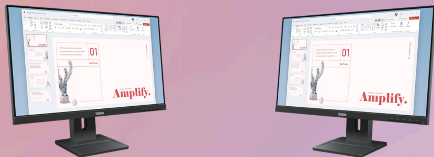
The product images are for illustration purposes only. Actual product appearance, ports, keyboard layout, and accessories may vary by model.